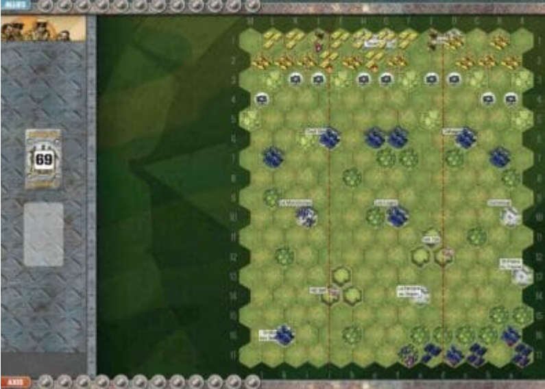
Memoir 44 scenario Coldstream Hill